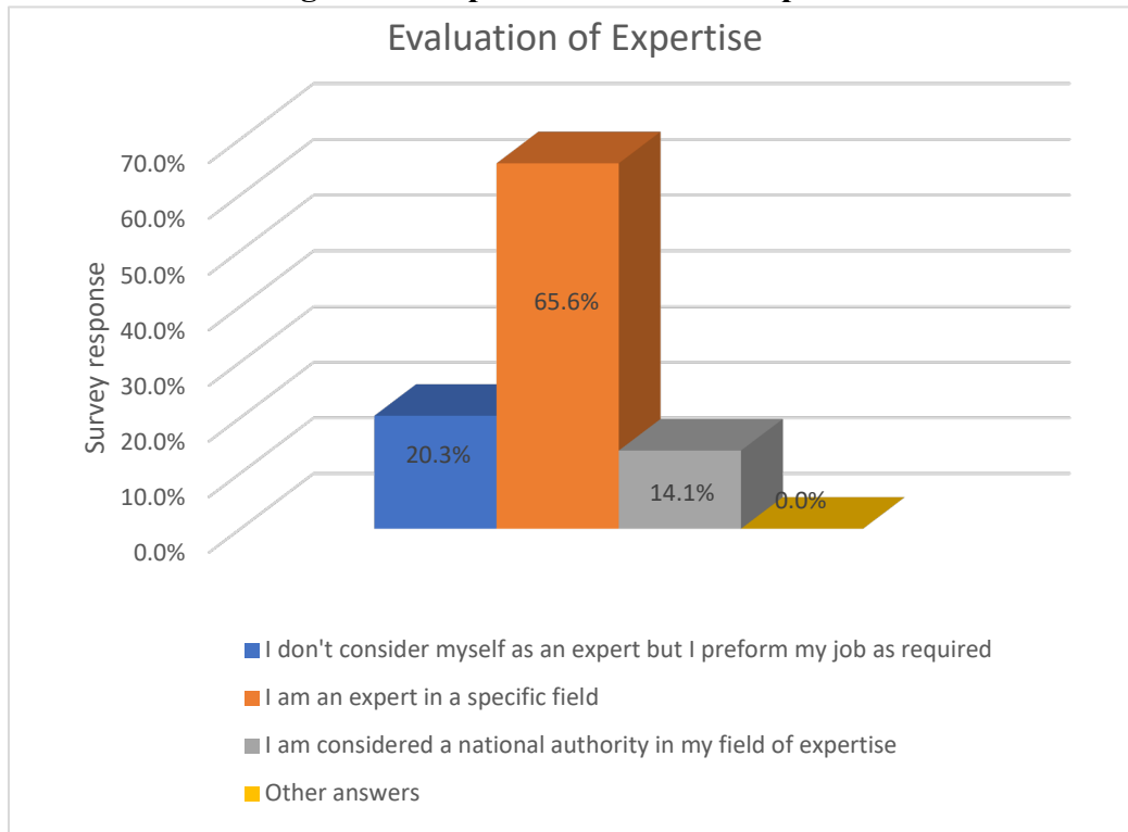
Figure 1: Responses to Level of Expertise